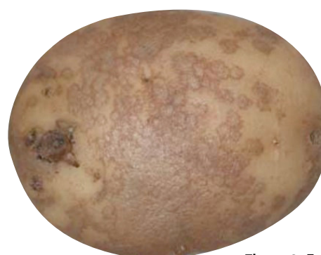
Figure 2: Example of a tuber affected by advanced black dot symptoms similar to silver scurf.