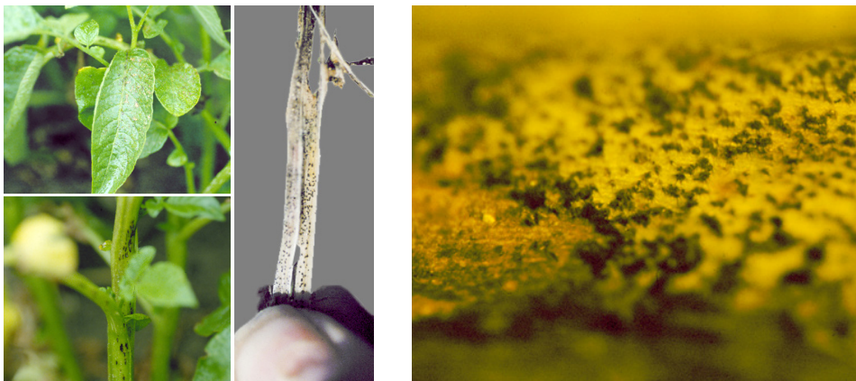
Figure 4. Sclerotia on stems and leaves of potato plants.