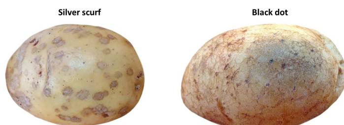
Figure 1: Comparison between tuber symptoms of black dot and silver scurf

Often mistaken for silver scurf ( Helminthosporium solani ), it is differentiated by the presence of small black dots (sclerotia) on the tubers (Figures 1 and 2). It is only in the past 10 years that targeted disease management strategies have been developed.