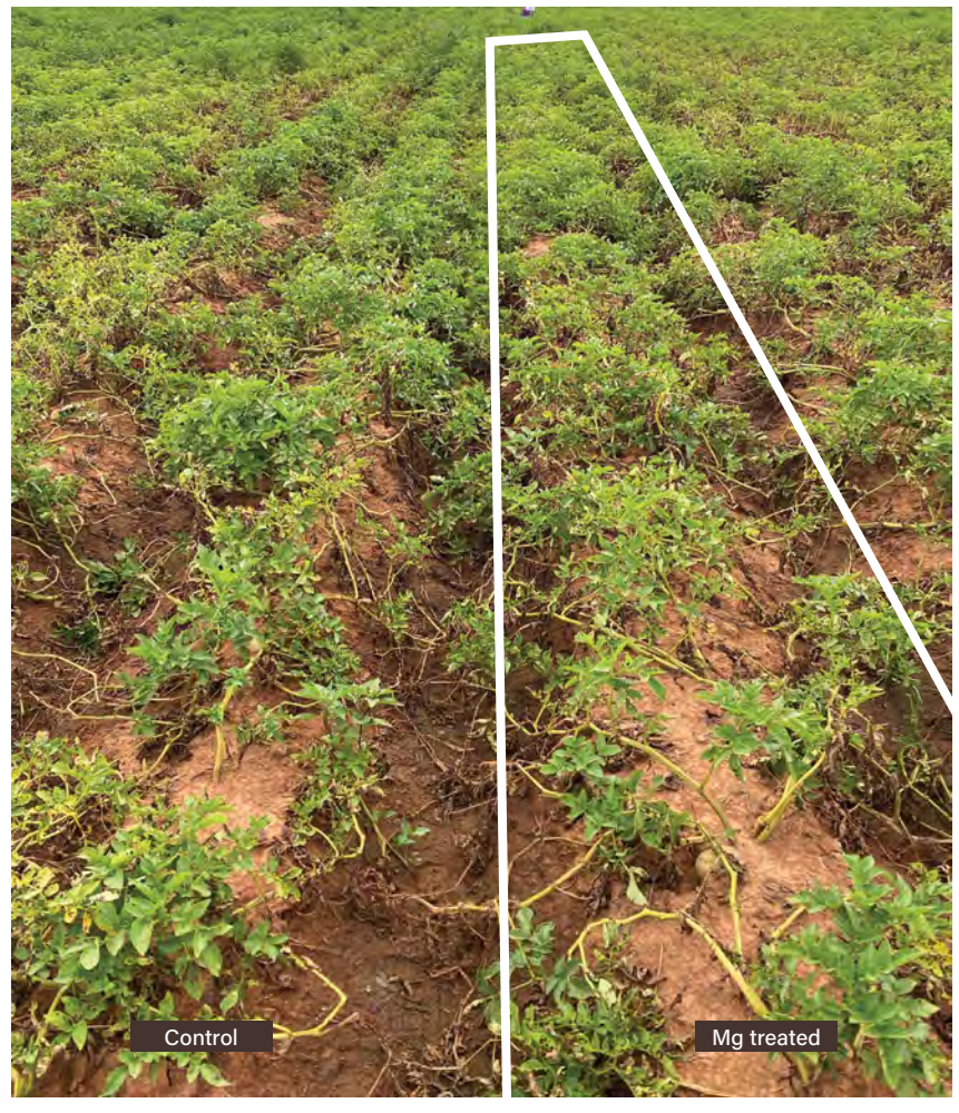
Figure 2. There were still no obvious differences between Mg treated and control plots one week before harvest