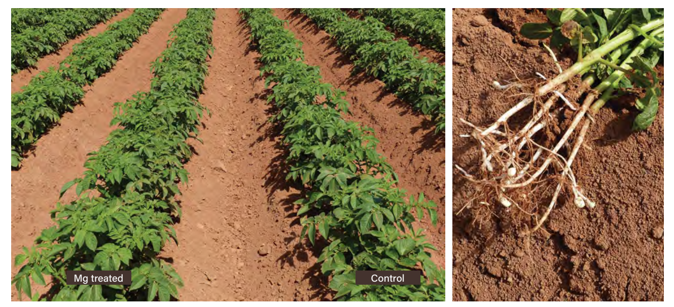
Figure 1. There were no obvious differences in growth between Mg treated and control plots (left) at tuber initiation (right)

The treatment was repeated a month later (23 November) when the potatoes were at tuber initiation